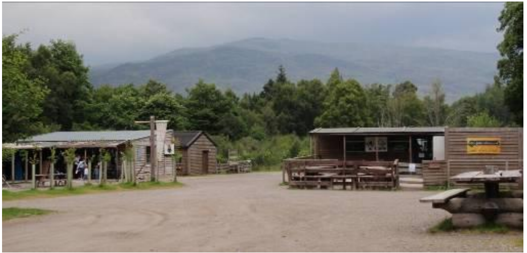
Fig. 2: Existing temporary structures